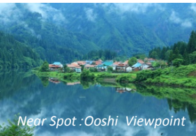
Near Spot :Ooshi Viewpoint