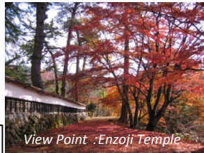
View Point :Enzoji Temple