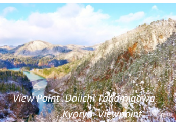
View Point :Daiichi Takadangoya Kyoryu Viewpoint

7:35 8:17 9:09 9:54 11:08 11:58 13:27 14:14 15:05 16:21 17:10 18:13